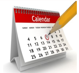
Important dates to remember!