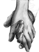
"Love one another as I have loved you."

C A M L J E W S A R P G O G F N Q V N U J K R U G D U E K D M B B G J M J J Y M B H L J Q C U M C L P Y J X D J L O L N N V L H D O N Y F N E G G A N X K R K P D R L S Q S A I E R A N F E J I K I P P U R R E Z R O J P A S L J F U S D H S D S W Z Z K C G Q H Y L T U N E L Y M O X I L K W I O G A O E G O E N L P O B H N Z M D V Y G I N O S L O C A D M L O S G S G V G E E K P U O O L Z M P F N T E E S N Q C T Z I T E B F A X R K R X L I T T L E J D