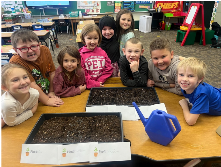
The 2nd grade students planted and grew microgreens in the classroom

In ELA, students learned how to write an informative/explanatory paragraph. They also learned how to write a letter. They learned that stories have a structure and wrote sequences of events. They all worked so hard and have shown amazing growth and perseverance.