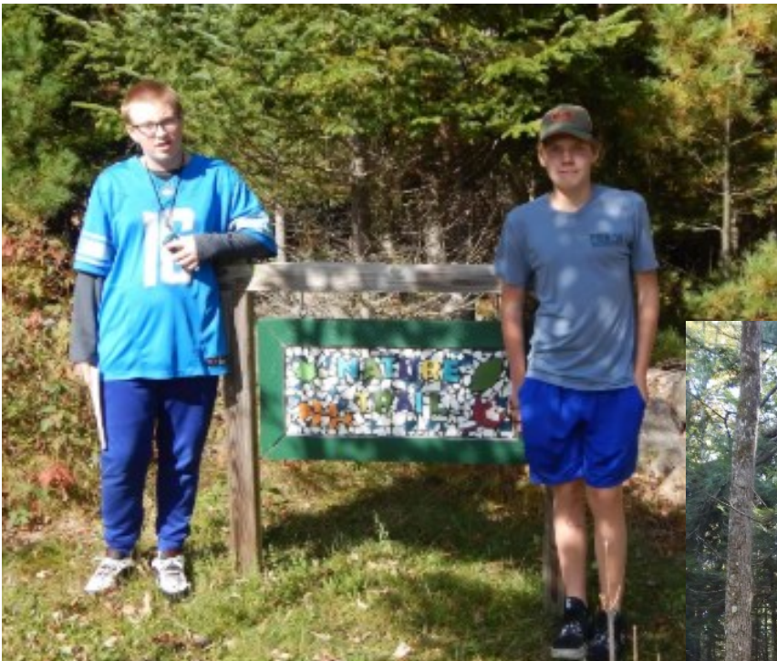
Mapping the Nature Trail

This year we offered a STEM class as part of the math and science curriculum. STEM stands for Science, Technology, Engineering, and Math. This course looks at a lot of the latest technologies and how they utilize both math and science that provides the frameworks that make these technologies work. So far, we have covered units on GPS/GIS technologies where we collect data using GPS units and then integrate that information onto interactive maps. Some other units covered have been coding and electricity and circuits. Currently, we are finishing up a unit on 3-D modeling using an engineering program called OnShape. We plan on doing additional units on robotics, forensics, and alternative energy systems. This is a great course that provides hands-on practical applications of math, science, and technology.