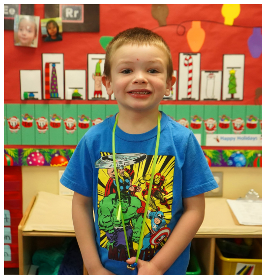
Everett Rothlisberger Preschool