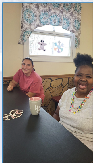
Enjoying some UNO