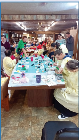
Art Class at Daycare