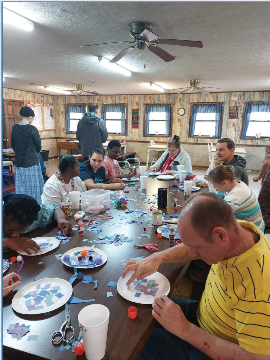
The Residents at Daycare