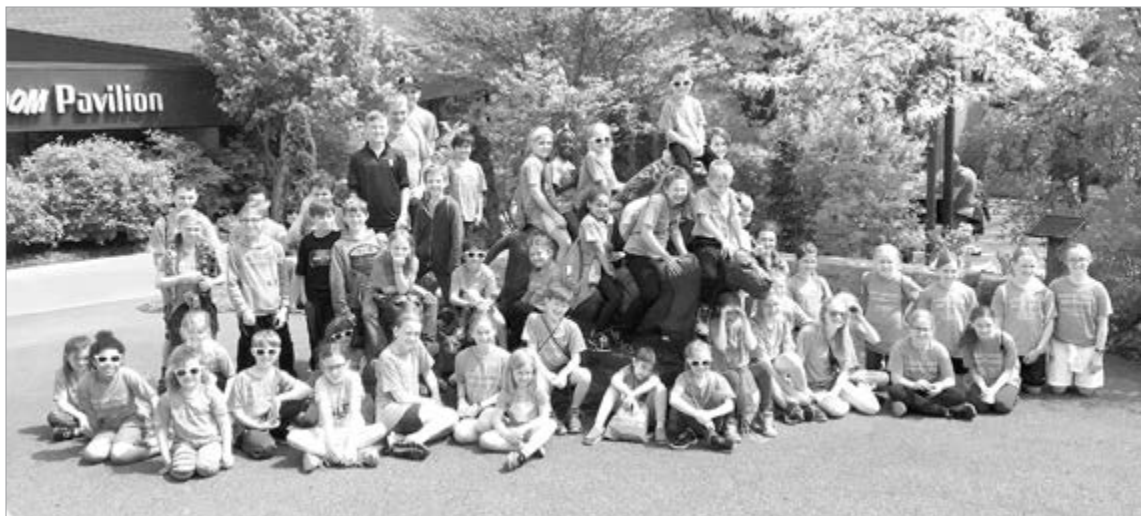
A Day at the Zoo — The elementary students spent the last Monday of the school year at the Henry Doorly Zoo in Omaha.