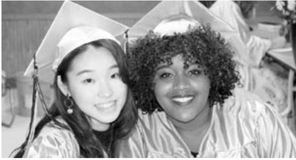
Class of 2018, continued from pg. 1