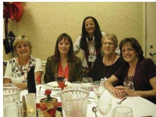
The Green Tie Class of 1989 gathered at SMA in September with a taco truck lunch and tours of the school.