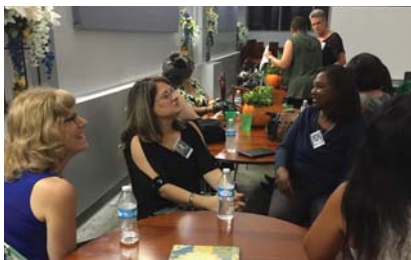
The Green Tie Class of 1977 held their 40th reunion in SMA's Hannon Dining Room.