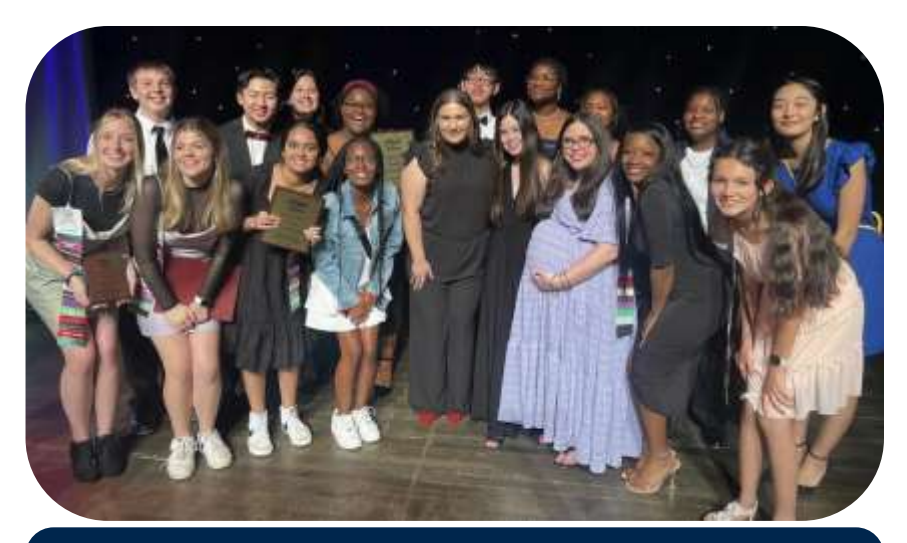
The HCHS FCCLA Chapter received the Financial Fitness National Program Award, Honor Roll with Distinction, and the greatest award that can be bestowed upon FCCLA chapters across the state - FCCLA Chapter of the Year.