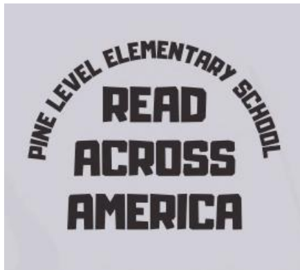
Front Design (where a pocket would be)