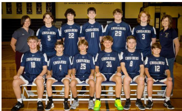
SAXONY MEN'S VARSITY VOLLEYBALL TEAM