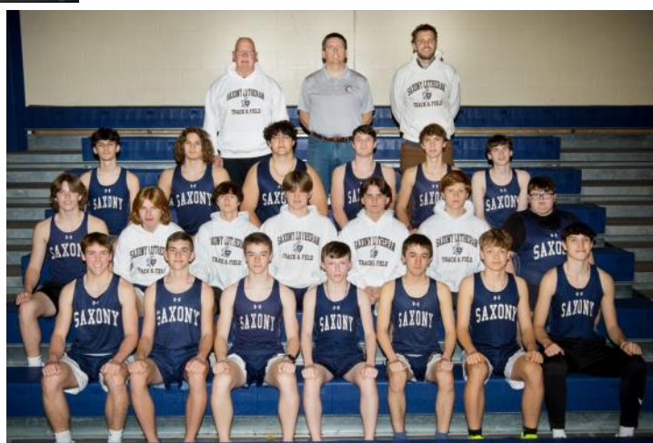
SAXONY MEN'S TRACK AND FIELD TEAM