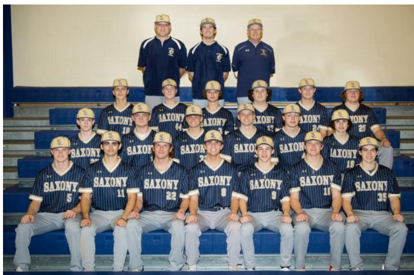
SAXONY MEN'S BASEBALL TEAM