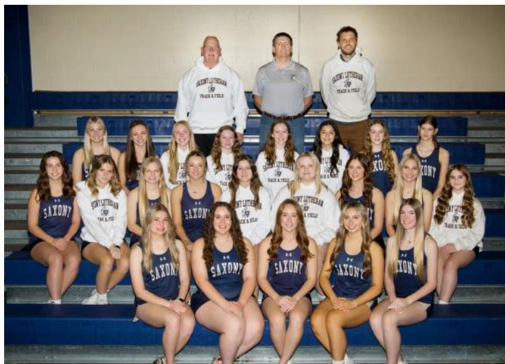
SAXONY WOMEN'S TRACK AND FIELD TEAM