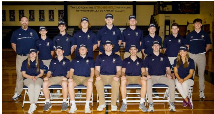
SAXONY GOLF TEAM