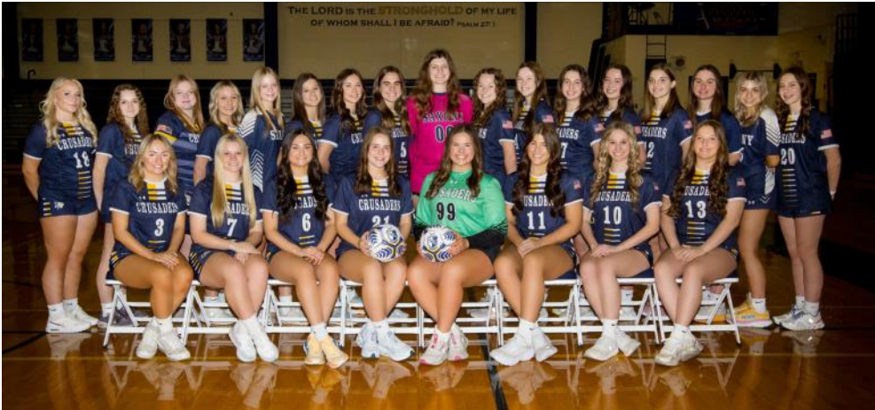
SAXONY WOMEN'S SOCCER TEAM