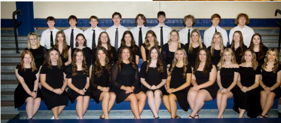
SAXONY CHAMBER CHOIR