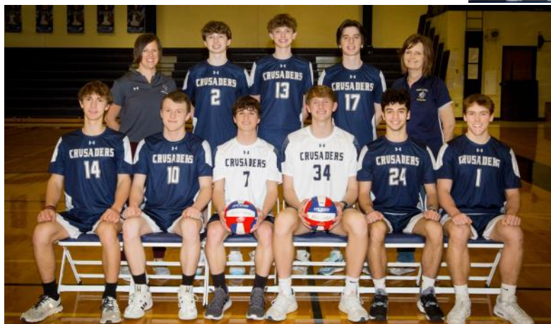
SAXONY MEN'S JV VOLLEYBALL TEAM