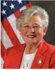
Kay Ivey, Governor President