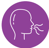
New loss of taste or smell