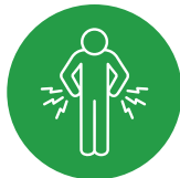
Muscle and body aches