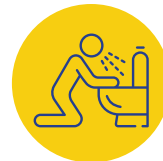
Nausea, diarrhea, or vomiting