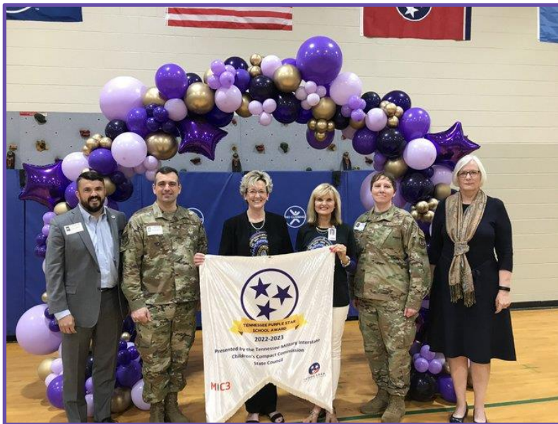
Robert E Lee Elementary School PSSA Award Ceremony