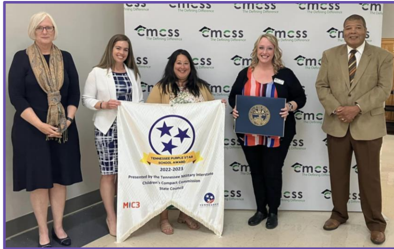
Clarksville-Montgomery County Schools PSSA Award Ceremony