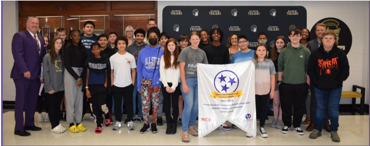
Millington Central High School PSSA Award Ceremony

Carpenters Middle School in Blount County received Tennessee Purple Star School Award