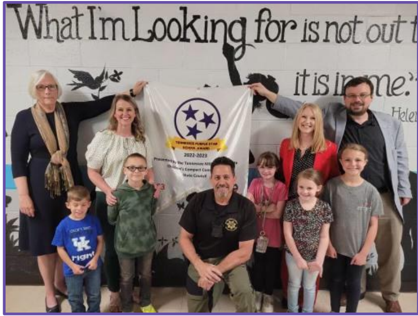
Ellen Myers Primary School PSSA Award Ceremony