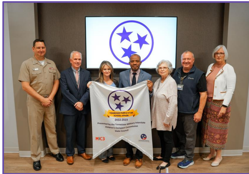
Arlington Community Schools PSSA Award Ceremony