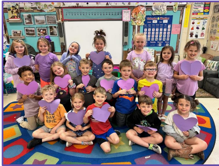
Ellen Myers Primary School MOMC Purple Up Day