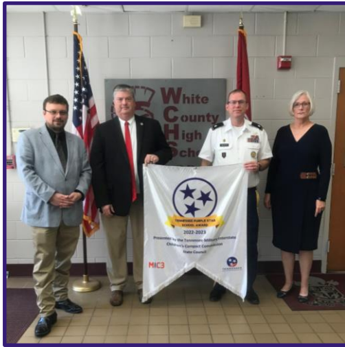
White County High School Schools PSSA Award Ceremony