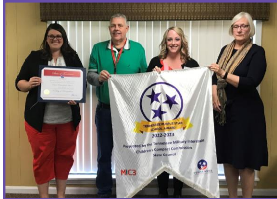
Stewart County Schools PSSA Award Ceremony