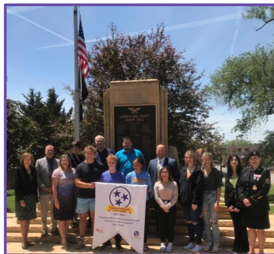
Cumberland County High School Schools PSSA Award Ceremony