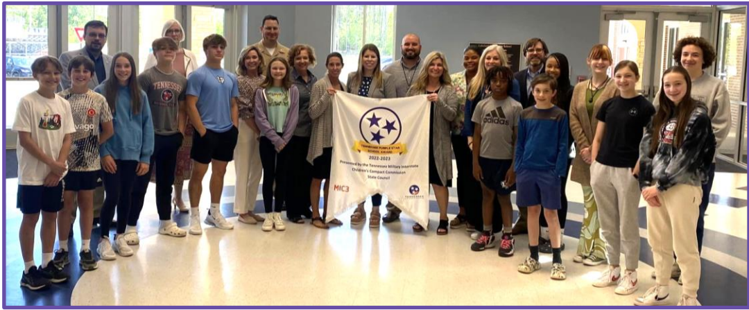
Lakeland Schools PSSA Award Ceremony