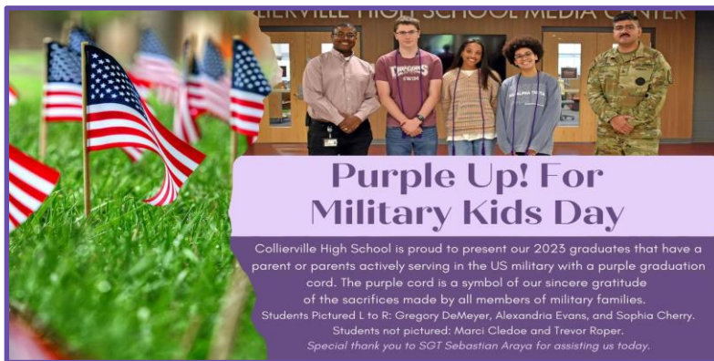
Collierville High School MOMC Purple Up Day