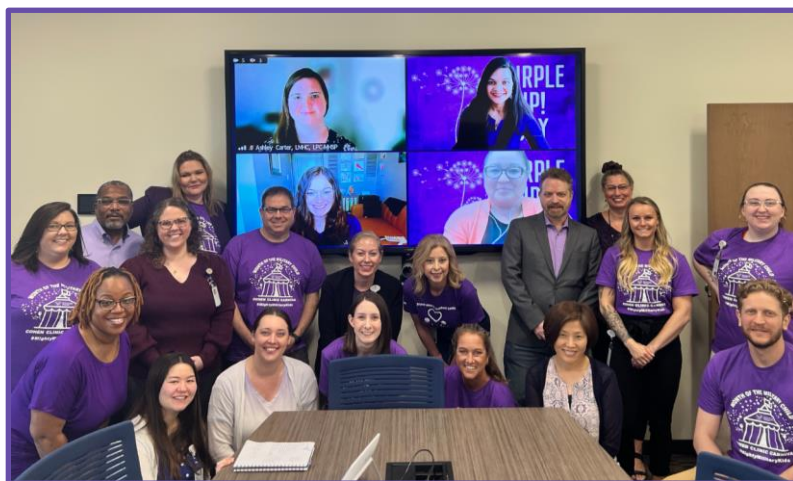
Steven A. Cohen Military Family Clinic, Clarksville, Tennessee