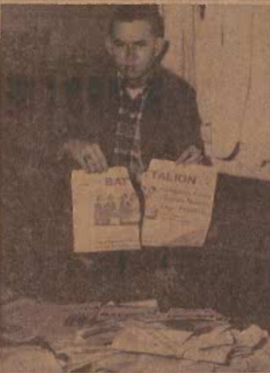
Signs of Protest

However, the final decision rests entirely with the Board of Directors, and no comment on the situation is available from there.