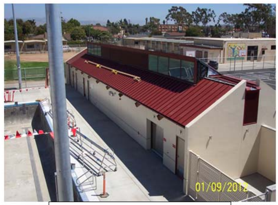
SMHS -Pool Construction Continued