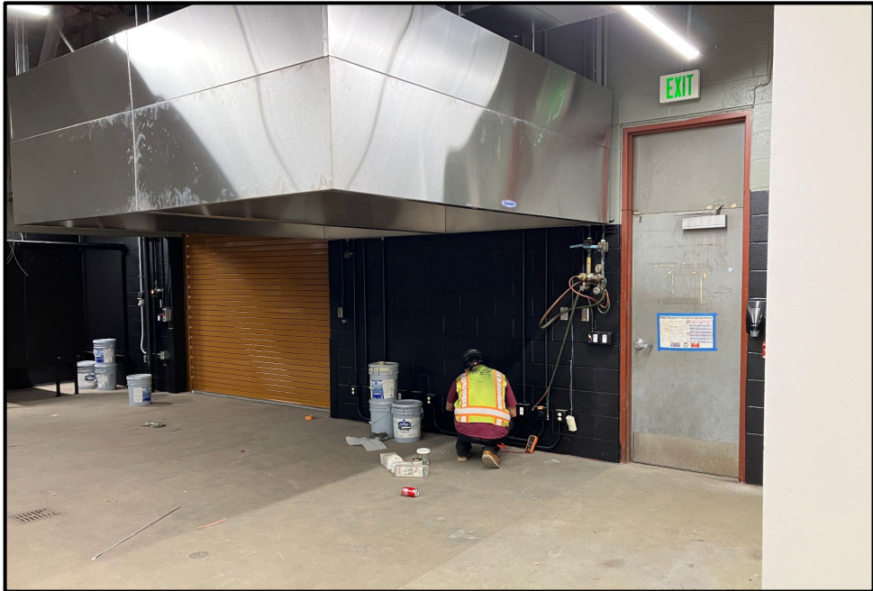
SMHS CTE Modernization – Installing Electrical Wiring in the Welding Shop