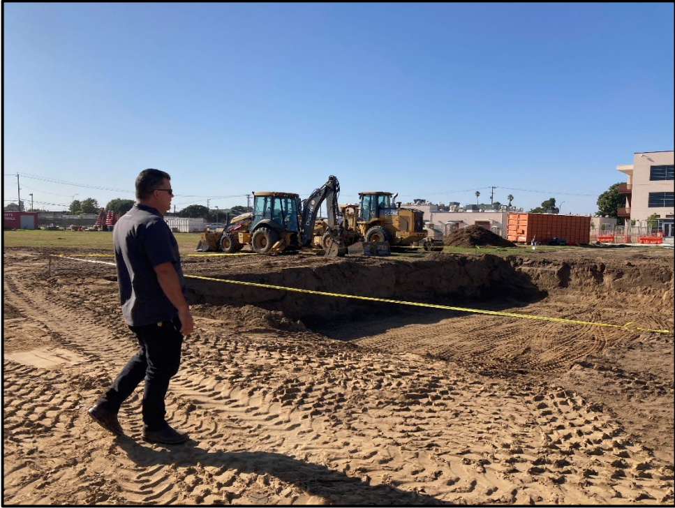
SMHS Softball Field – The Previous Field is Excavated to Ensure Proper Compaction for the New Field