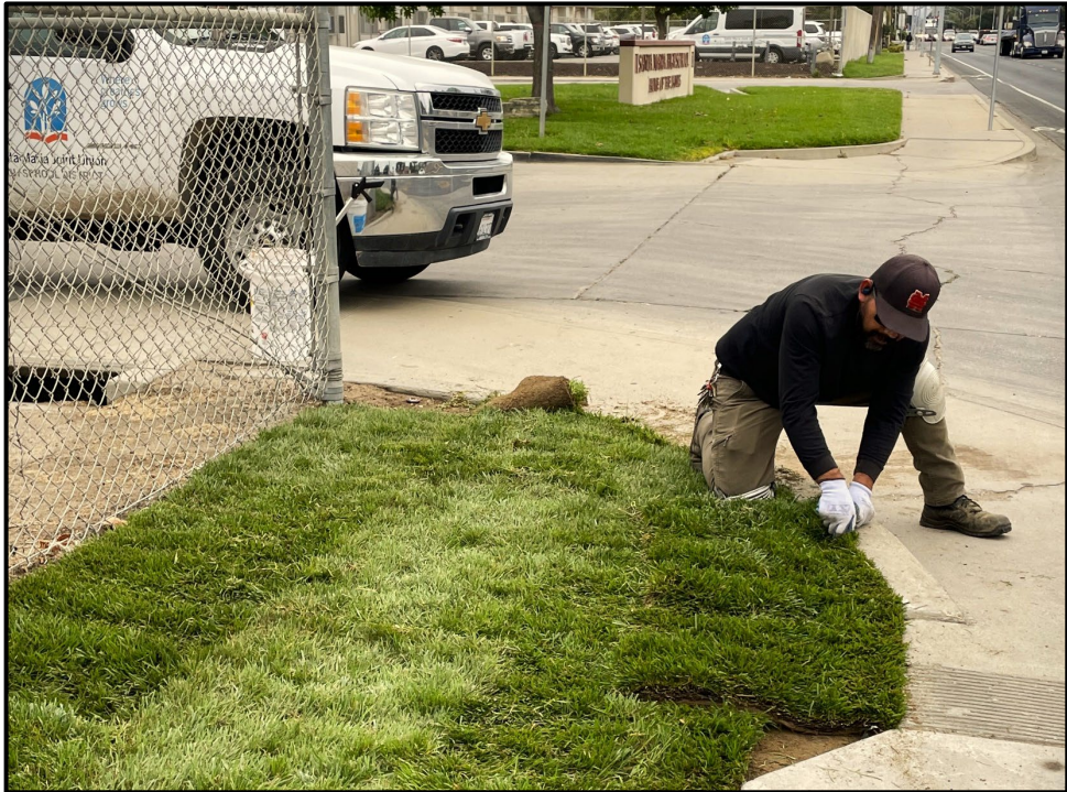
SMHS – Nelson Frutos Planting New Sod Along Stowell Road