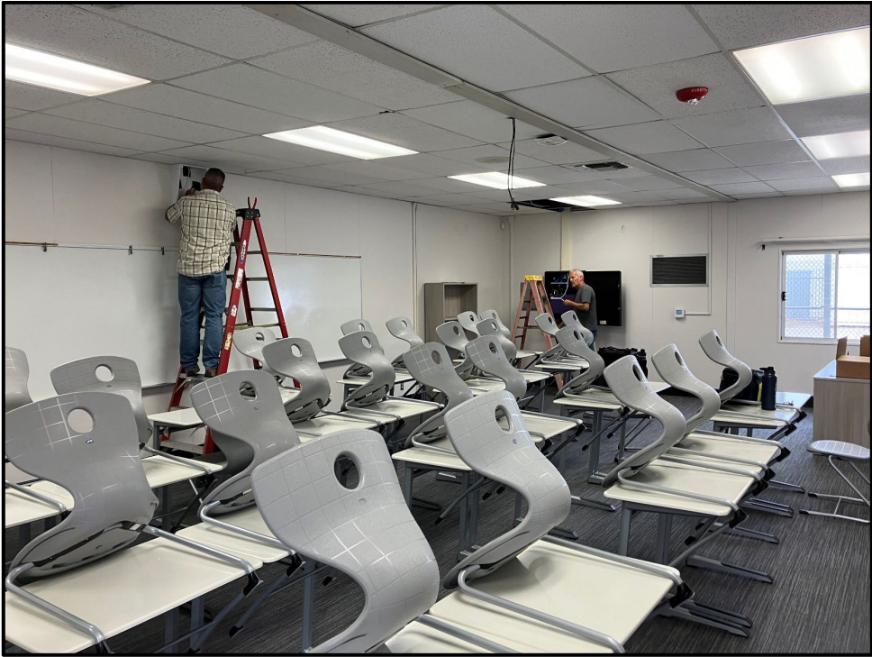
PVHS New Modular Classrooms – Electricians Installing IP Clock-Speakers