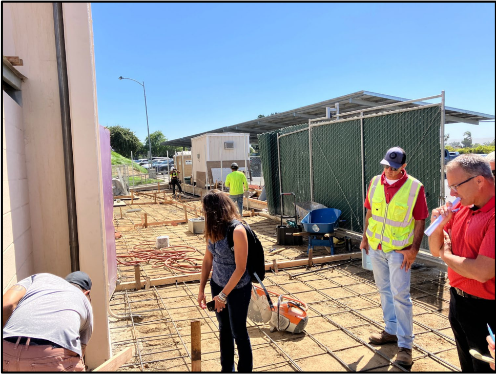
ERHS CTE Modernization – Construction Team is Inspecting the Forming and Rebar for the Welding Shop Exterior Concrete