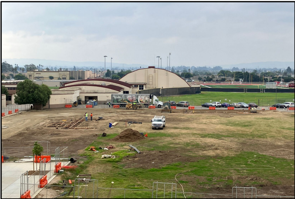
SMHS Softball Field – Foundations Take Shape for Backstop Fences and Dugouts