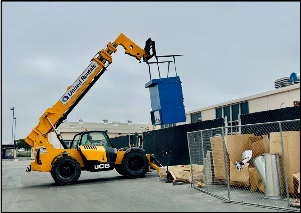
ERHS CTE Modernization – Wood Shop Dust Collector is Set in Place