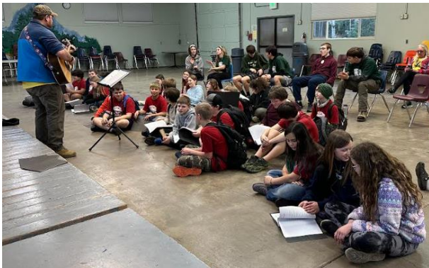
Site reading and singing songs.