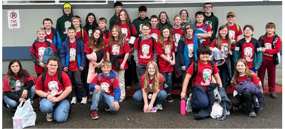
Elementary students and high school counselors attending Cispus get ready to go!