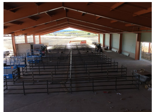
New CTE Center/Ag Farm January 2020 Construction Progress