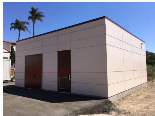
New Electrical Building Summer 2020 Substantial Completion