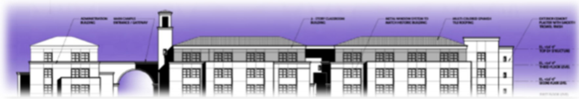
Santa Maria High School Design Rendering - Rachlin Architects

The Measure C2004 and Measure H2016 Bond Oversight Committee (Committee) has been established to actively review and report on the expenditure of voter-approved bonds, receive and review copies of annual performance and financial audits, and present an annual written report.