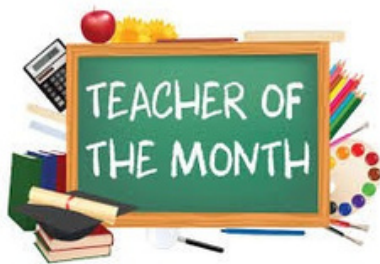
Amite County Elementary School