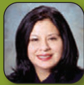
Consuelo Castillo Kickbusch