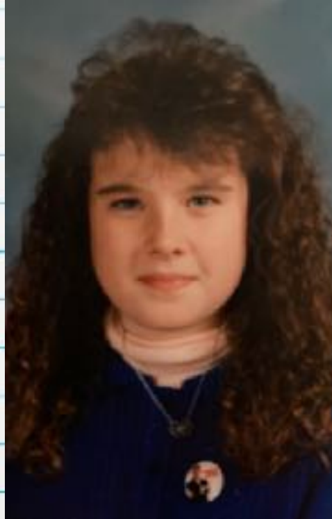
WILLOW OAKS ELEMENTARY MEMPHIS, TN SIXTH GRADE 1990