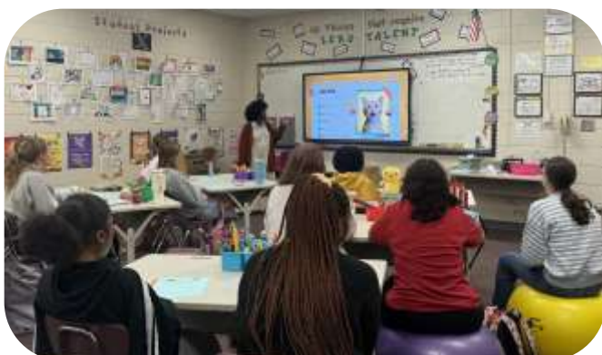
Ms. Washington is pictured at left as she goes over her morning meeting agenda with 1 st block students.