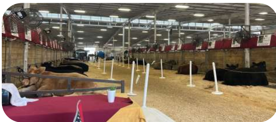
The isle recognized by the maroon curtains and signs that describe each showman's animal.

Perry FFA is proud to represent the Perry community and the future of Georgia agriculture at the Georgia National Fair each year.