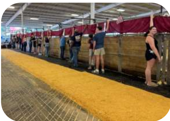
The showmen are pictured setting up the isle before the fair opens.