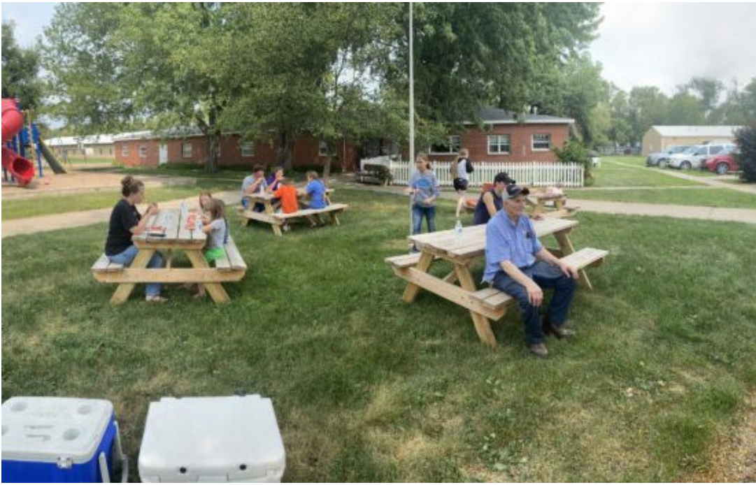
Lunch was provided for the groups that came to work each day.