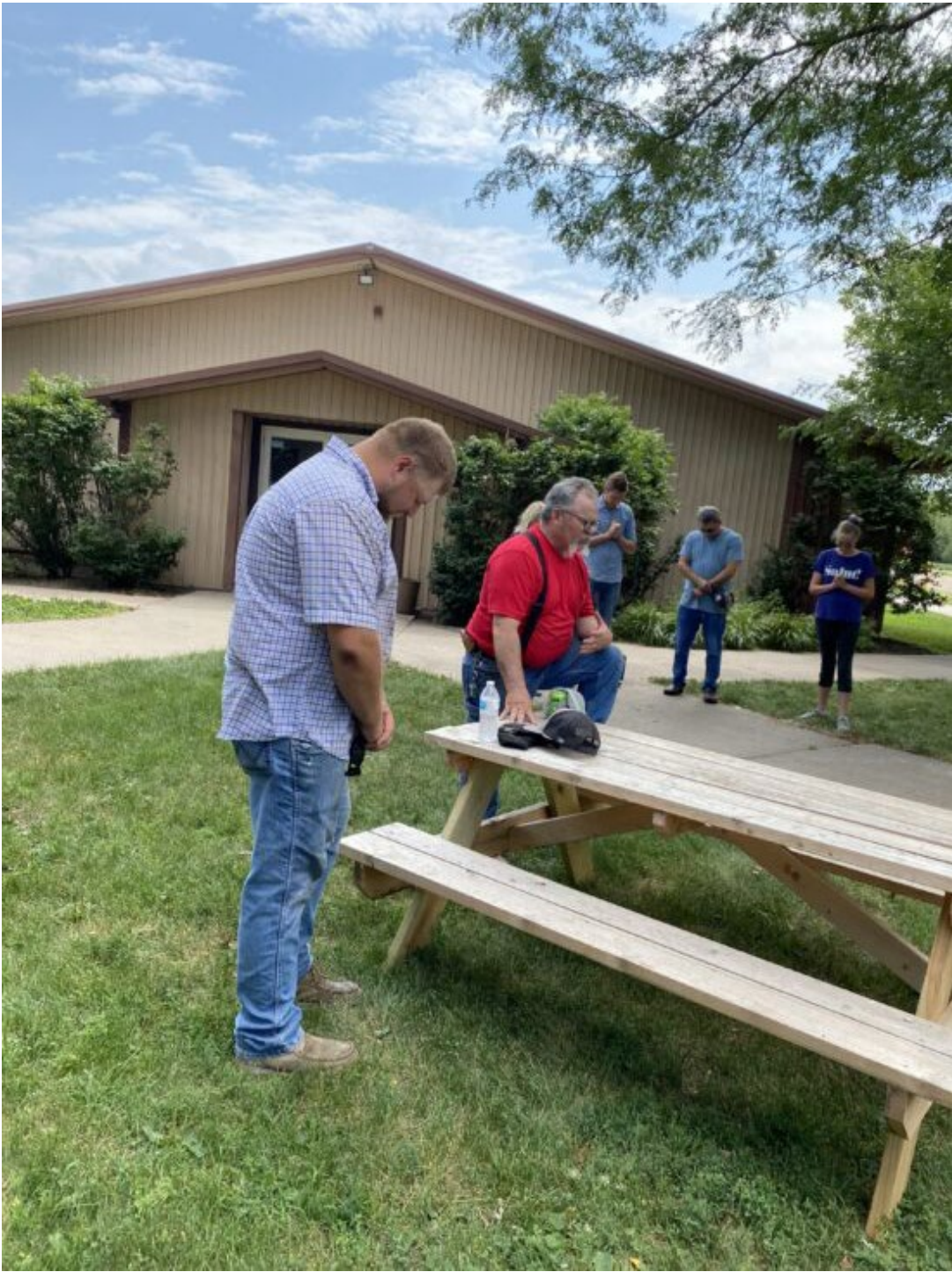
In the midst of the busy days, it was a blessing to all to pause and thank the Lord for His work at NC and pray for the school year to come.