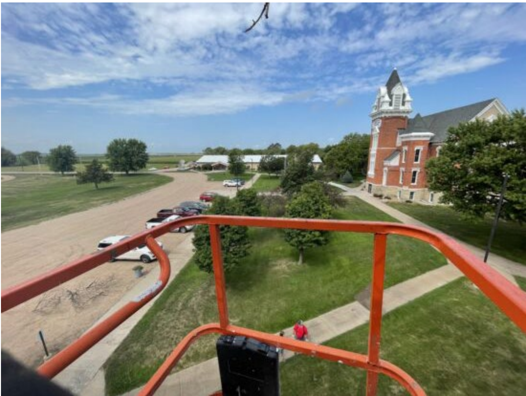
A bird's eye view of campus taken by Curtis Heuermann while trimming trees.