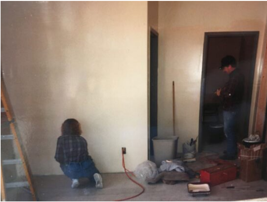
A team works on northwest entryway to the Gym Building. The gentleman is standing in the mens' bathroom doorway.