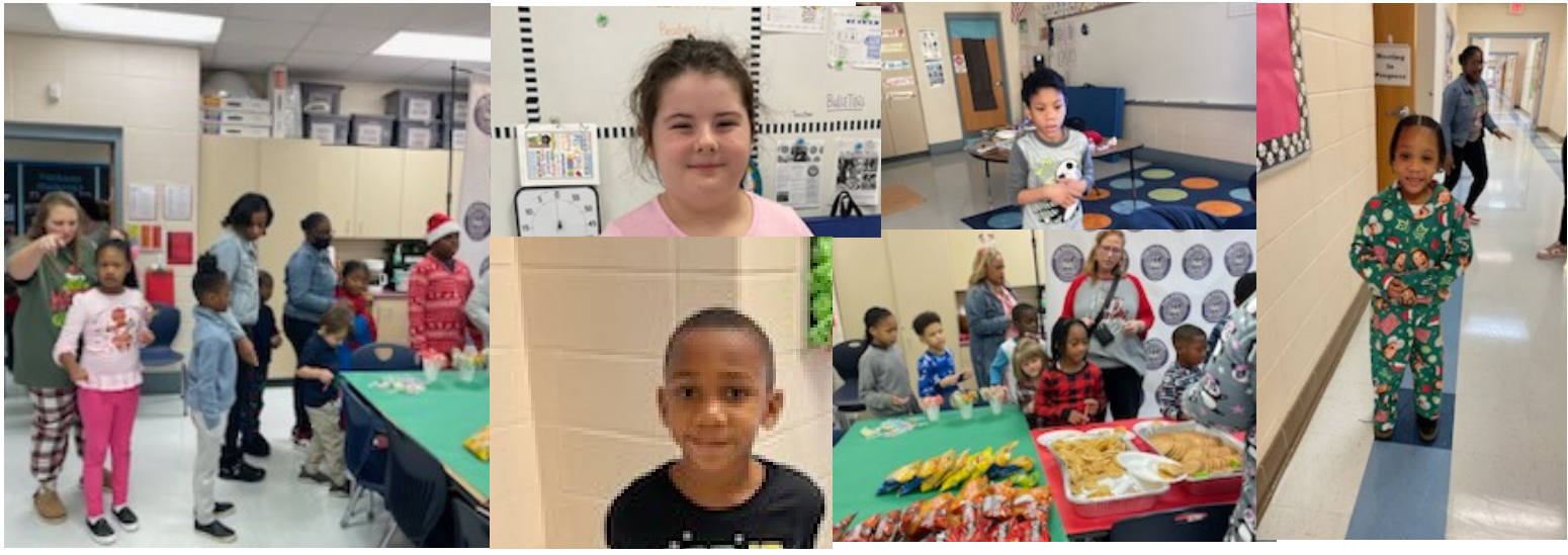
We appreciate all of our dedicated parents! Thank you for being an active participant in our educational journey. Pathway K-5 Parents, you are appreciated!!!