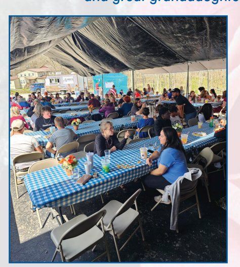
Everyone enjoying the day