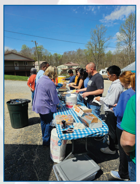
Thankful to all those that helped make the day great