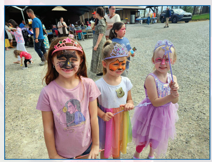
The children loved the toy barrel they got to choose things from