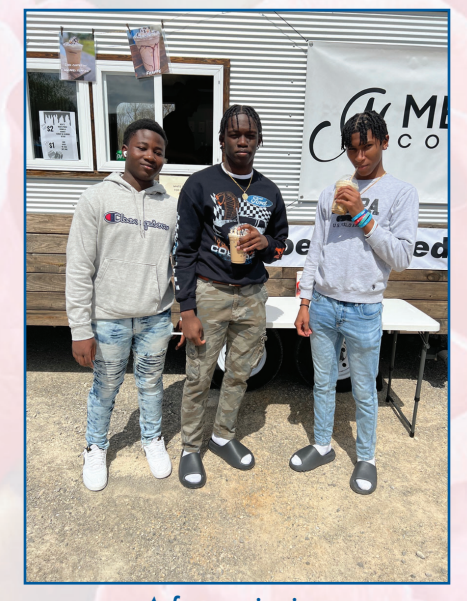
A few enjoying the local coffee truck