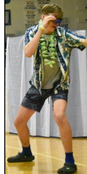
SENIORS RULED THE WEEK