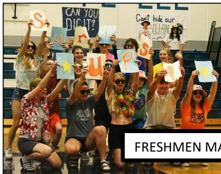
FRESHMEN MADE A GREAT SHOWING!