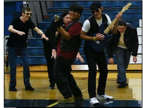
JUNIORS ROCKED THE DANCE!