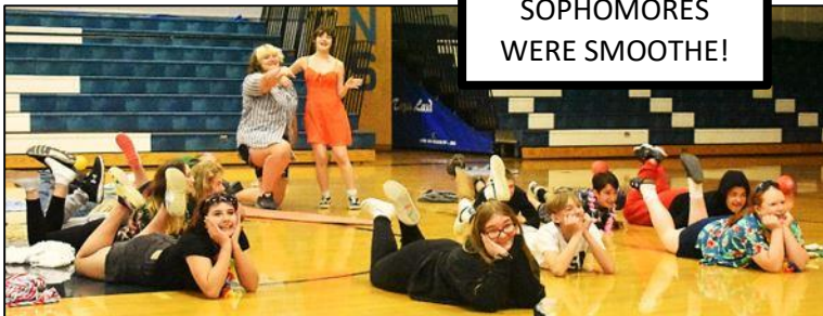
SOPHOMORES WERE SMOOTHE!