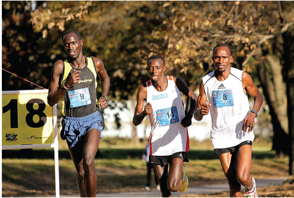
FIGURE 1.7 Marathon Runners Runners demonstrate two characteristics of living humans—responsiveness and movement. Anatomic structures and physiological processes allow runners to coordinate the action of muscle groups and sweat in response to rising internal body temperature.