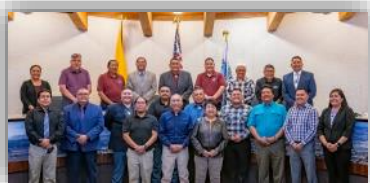
Governor and staff