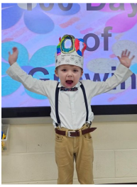
Yay for 100 Days