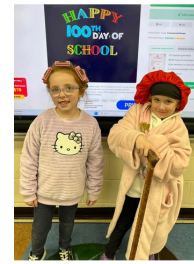
Little Old Ladies