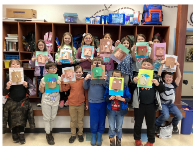
In art students had fun making 3-D faces.

In class both grades are working hard to deepen their understanding of fractions. The fourth graders are learning how to multiply fractions. In ELA students spent the week going over a previously written essay. They learned to peer review with classmates and to point out both the strengths and areas of improvement. They then used this information to rewrite their essays taking into account the feedback they received in order to improve their writing.