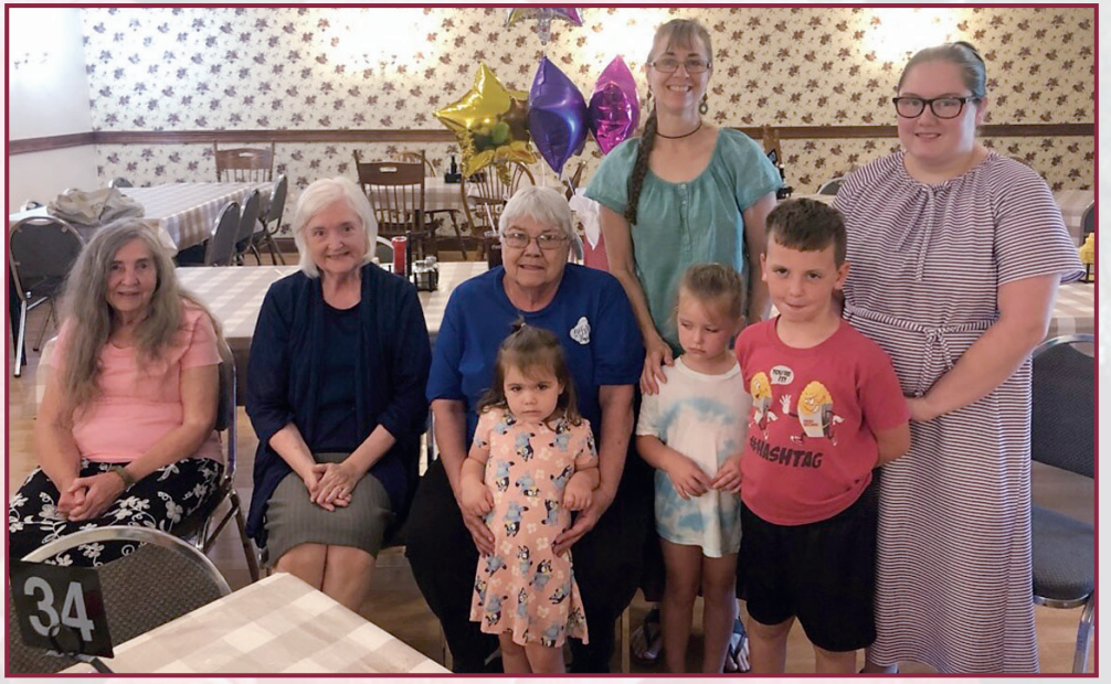
Celebrating Work Anniversaries at the Café