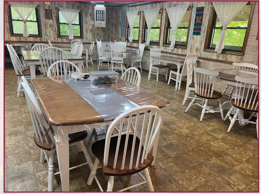
The wonderful refurbish job by a couple of work teams