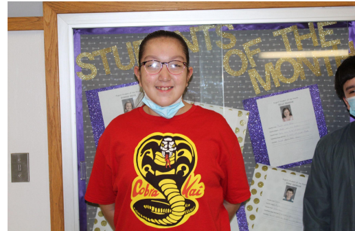
Article by Paris Burdex