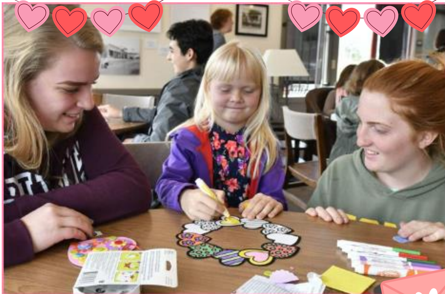
Valentine's day crafts!

In a great many of our projects, children not only received books cost-free such as in our book distribution projects, but they engaged in inclusive literacy-focused activities such as our library events or contributions to local family day events. With our free craft event we hold every month at the Orcutt Branch Library, we are able to pass out books as well as provide volunteers an opportunity to help children with crafts that we provide at no cost.