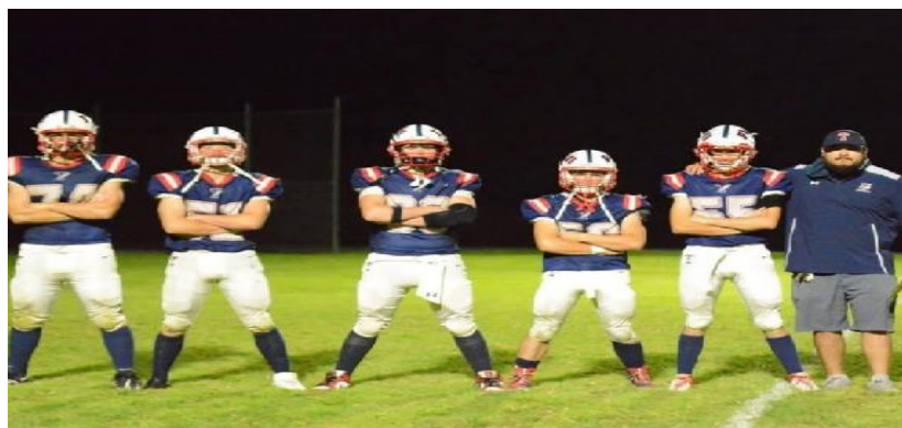
The Titans small but mean offensive linemen!