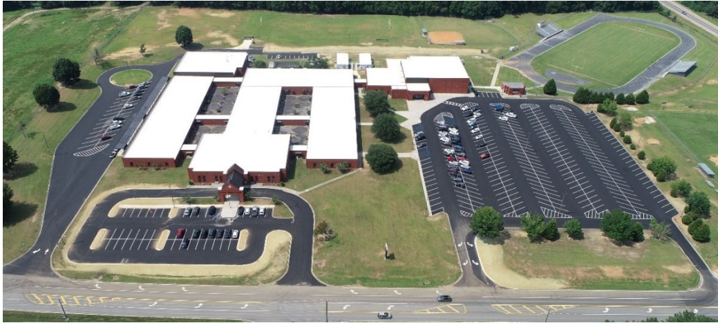
Bonaire Middle ( top ), Feagin Mill Middle ( bottom left ), Perry Middle ( bottom right )