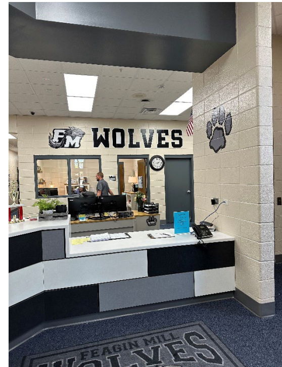
Feagin Mill Middle