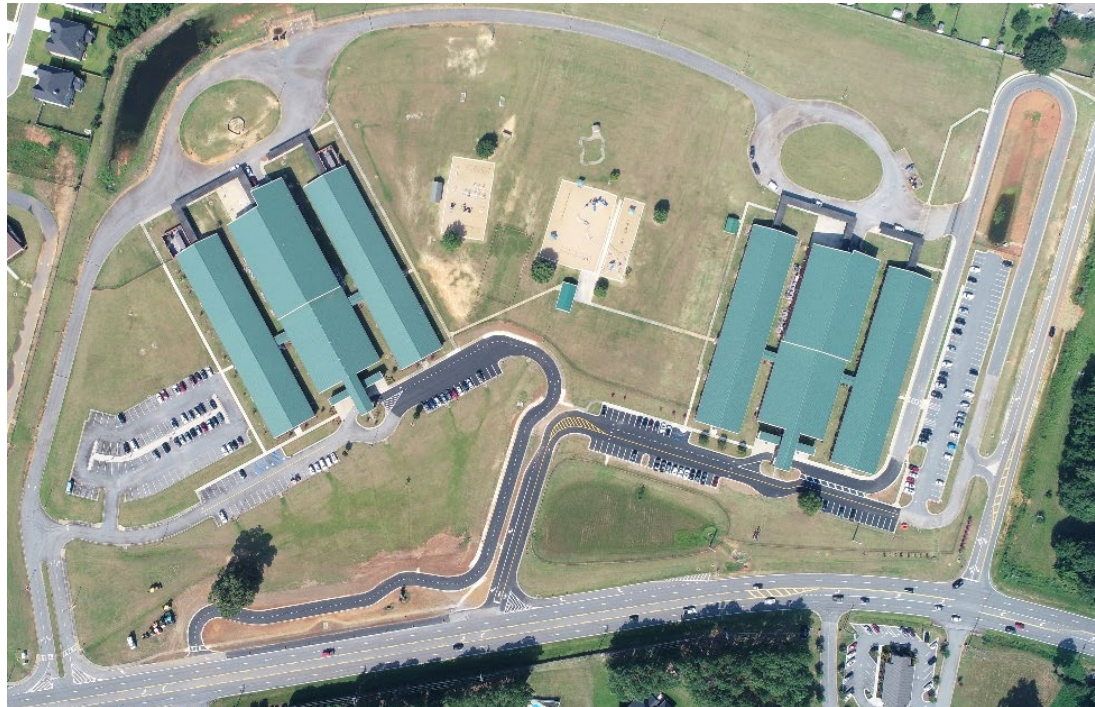
Lake Joy Elementary and Primary

★ Several schools received parking and drive improvements.