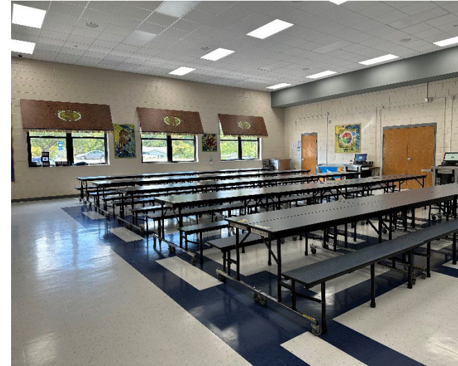
Shirley Hills Elementary