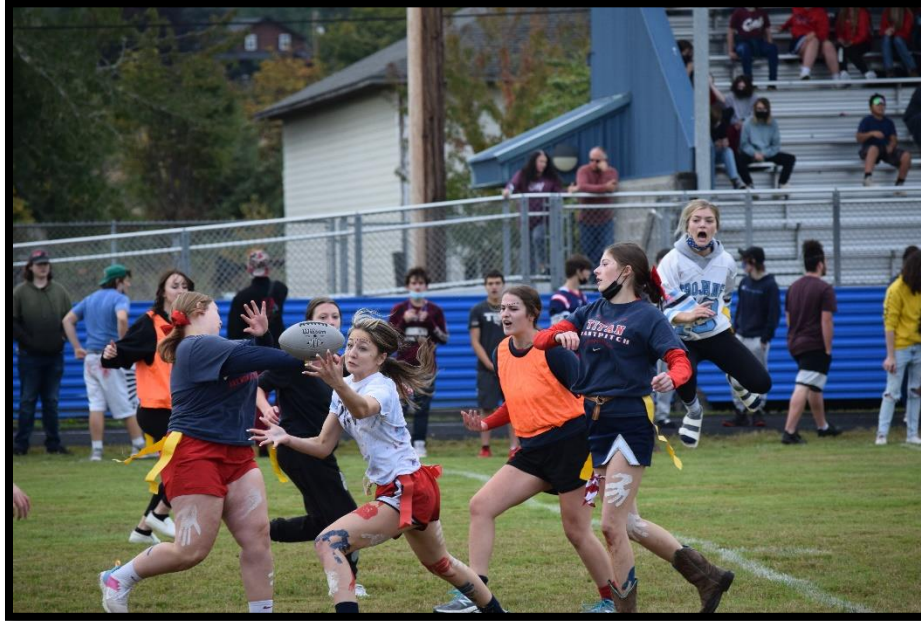
1. The Junior/Sophomore team dominates the field during the female football game.