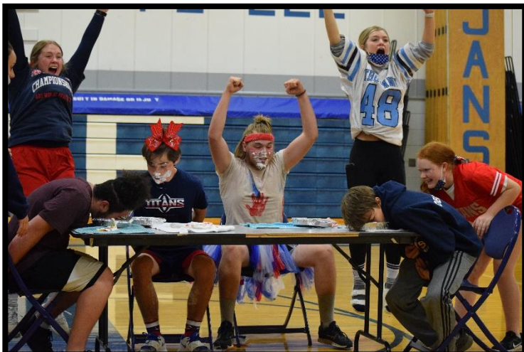
7. The Juniors eat up their competition during the pie contest.