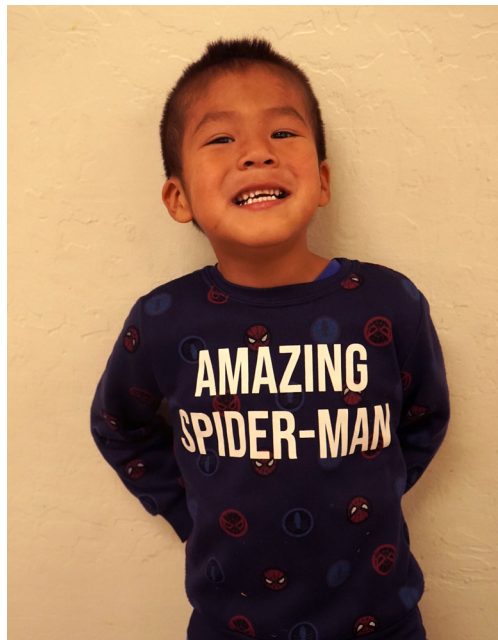
Ares Week Preschool