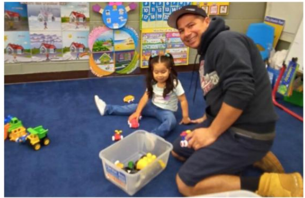
Landis Square Residents Enjoy A Day Of Fun, Fellowship, And Ice Cream Sundaes