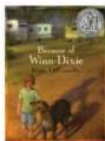
5th & 6th Grade Tuesday, February 15 4:00 to 4:45

For more information about all other Children's Programs at the Library, go to: