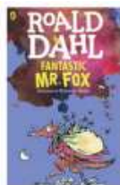
3rd & 4th Grade Tuesday, February 8 4:00 to 4:45