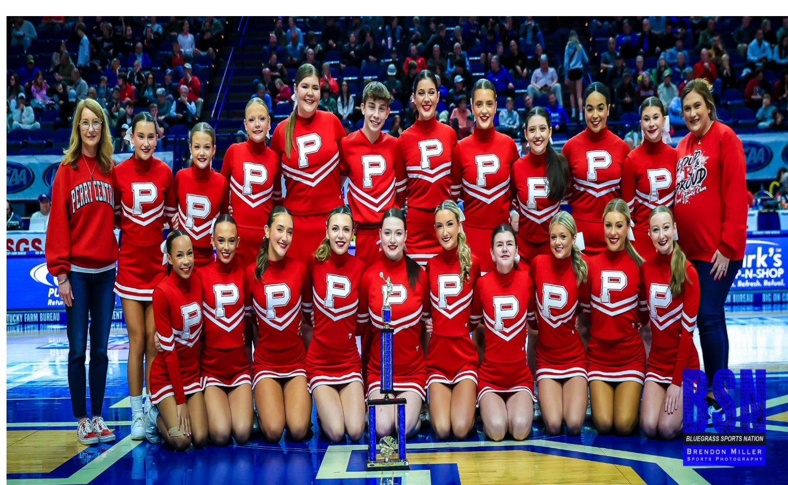
Congratulations to the PCC Cheerleaders for winning 1st place at the Sweet Sixteen State Tournament for the In-game Competition.