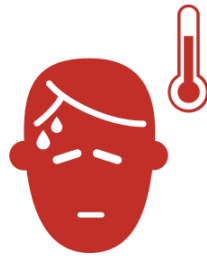
High Fever ( \geq 101^{\circ}\text{F} )