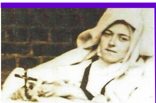
An installment from The Passion of Thérèse of Lisieux by Guy Faucher

Sister Thérèse was buried in the late morning of Monday, October 4, 1897, in the town cemetery, on the hill overlooking Lisieux. Thirteen years later, on September 6, 1910, that tomb was opened by order of the Church authorities. The diocesan process had begun with a view to the eventual canonization of Sister Thérèse of the Child Jesus and of the Holy Face.