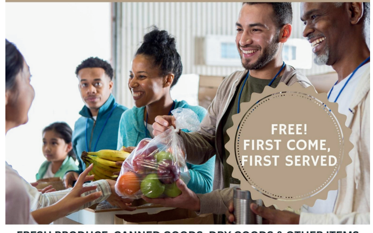
FRESH PRODUCE, CANNED GOODS, DRY GOODS & OTHER ITEMS