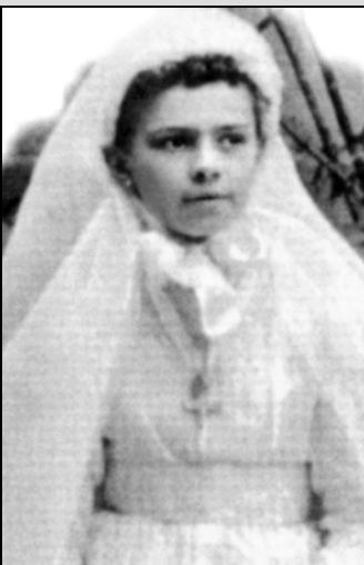
First Communion Day (4/19/1891)