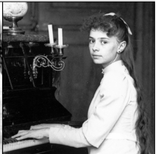
Practicing while a student at the Conservatory of Dijon, France