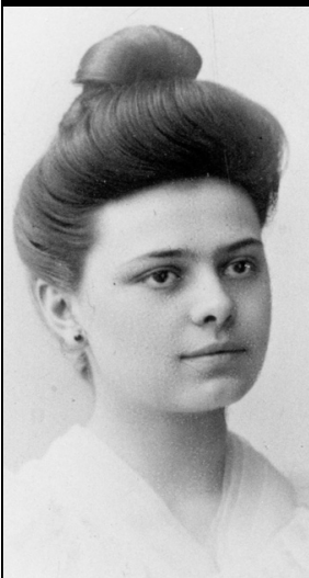
At the age of twenty

receiving the name "Sister Elizabeth of the Trinity." Her awareness and experience of the Triune God dwelling within her continued to grow. Through her communion with Christ in the Eucharist and in the Scriptures, the young Carmelite's spiritual life deepened even more. Although she drew nourishment from the teachings of the great saints of Carmel, she named St. Paul as "the father of my soul," as he preached "nothing but the mystery of the charity of Christ." On November 21, 1904, the feast of the Presentation of Mary, Elizabeth composed her famous prayer to the Trinity. This prayer is like an offering of herself to the God who is Love. It was only two years after composing it that Elizabeth departed this life—after many months of suffering from Addison's Disease, a malady of the kidneys which, at that time, was incurable. Her final illness caused great fatigue, an inability to digest food, intense abdominal pains, and great thirst. She wrote that she felt as though tiny beasts were devouring her insides, and said that one of the first things she would do in Heaven was to have a drink of water. Her community noted the great patience, courage, and joy with which Elizabeth suffered.