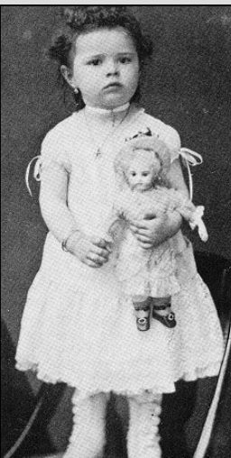
Age 22 months w/her favorite doll

As she was waiting to join the Carmel, Elizabeth lived the life of a typical young, active Catholic laywoman of her time. She sang in two choirs in her parish, helped prepare children for their First Communion, and began a type of day care for the children of those who worked in a tobacco factory. Elizabeth was also a very gifted musician. From the age of seven, she studied music at the Conservatory of Dijon, winning several prizes for her piano skills. Finally, in 1901, Elizabeth entered her beloved Carmel,