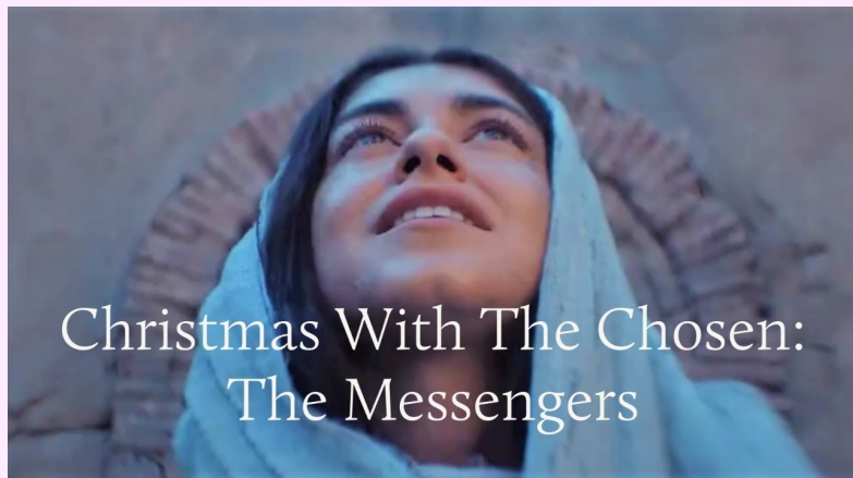
Christmas With The Chosen: The Messengers

It will be shown in the parking lot (weather permitting) following the 5:00 p.m. Mass—at approximately 6:15 p.m. Before the movie, there will also be a Christmas Concert, followed by this special Christmas movie.