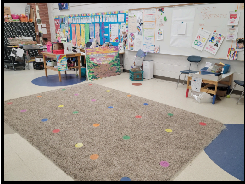
This is the art room where you will create with different materials.