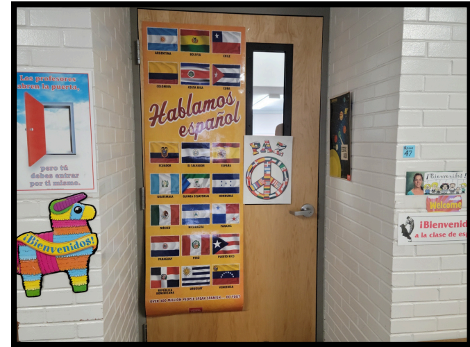
You will also have an opportunity to learn about a world language.