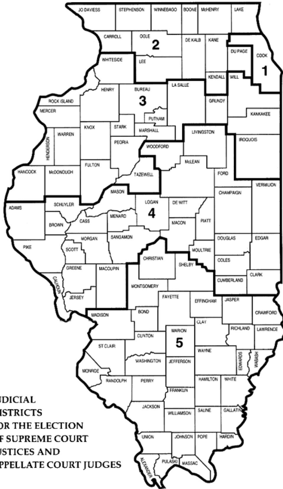
JUDICIAL DISTRICTS FOR THE ELECTION OF SUPREME COURT JUSTICES AND APPELLATE COURT JUDGES