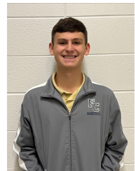
Tyson Windom Construction