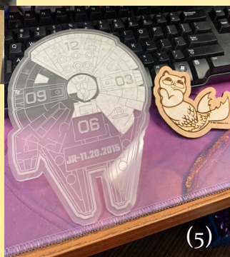
5) Laser-etched clock face and keychain