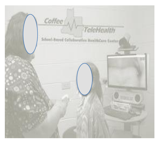
Figure 2: Coffee Telehealth Photo